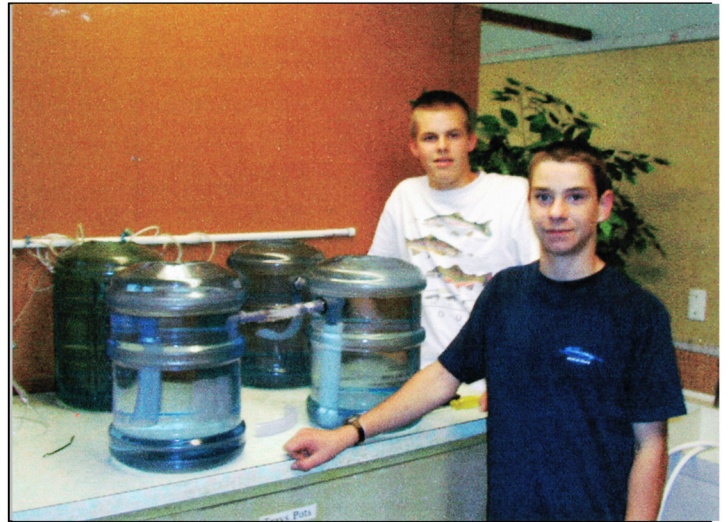
Fortuna High School students with a "Classroom Living Machine" which simulates a wetland.

Fortuna: CCWI has partnered with two great groups doing water quality monitoring in the Fortuna area: The Fortuna Creeks Project, based at Fortuna Union High School, and Friends of the Van Duzen, a local watershed group. The Fortuna Creeks Project, a creek monitoring project of students at Fortuna Union High School, tests 5 water quality parameters on Mill, Rohner, and Strong's Creeks, and the Eel River. CCWI set up a Classroom Living Machine at Fortuna High School to teach students about principles of wastewater treatment. Friends of the Van Duzen, a watershed group and member of the Humboldt Watershed Council, is coordinating watershed education projects with three schools in the Fortuna area with support from CCWI. CCWI is offering a research stipend to three HSU students to work on water quality issues in Fortuna in Spring 2003.