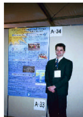
The Water and Climate Poster in Kyoto, Japan